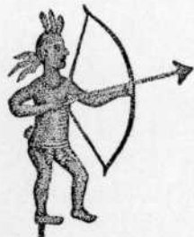
THE PROVINCE HOUSE VANS